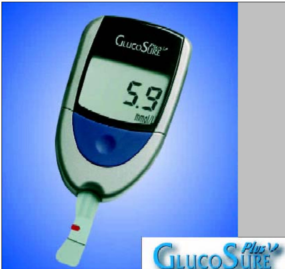
The picture shows the meter with the inserted test strip in approximately real size.