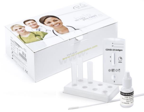
Figure 2. NADAL COVID-19 Ag Test.

The NADAL COVID-19 Ag Test is a lateral flow chromatographic immunoassay for the qualitative detection of SARS-CoV-2 viral nucleoprotein antigens in human nasopharyngeal, nasal, and oropharyngeal specimens. New kits are only available with pre-filled ampoules. The evaluated test kit is for medical trained personnel only, but a test kit is for self testing is also available.