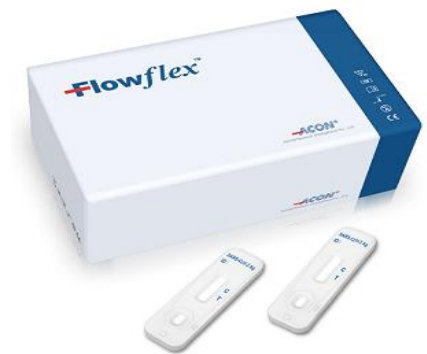
Figure 2. Flowflex SARS-CoV-2 Ag Rapid Test

The Flowflex SARS-CoV-2 Ag Rapid Test is a lateral flow chromatographic immunoassay for the qualitative detection of SARS-CoV-2 viral nucleocapsid protein Ag in human nasal and nasopharyngeal specimens.