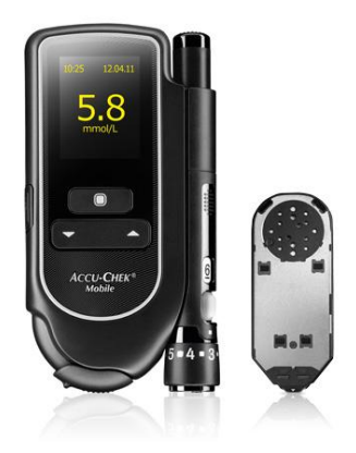
Figure 1. Accu-Chek Mobile meter and test cassette

The meter has the capacity of storing 2000 test results in the memory.